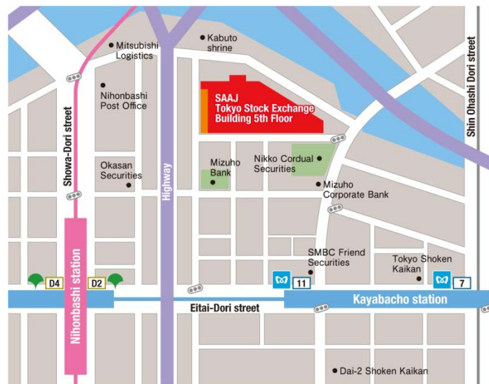
MAP - SAAJ Seminar Room 1

February 25, 2012 SAAJ Seminar Room 1, Tokyo, Japan